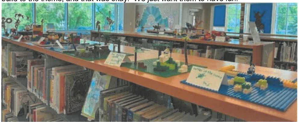
LEGO creations on display in the kids' area

LEGO Club was a little smaller this month, though still a popular program. The theme was "animals in their habitat" and the kids got really creative. Not everyone chooses to build to the theme, and that was okay. We just want them to have fun!